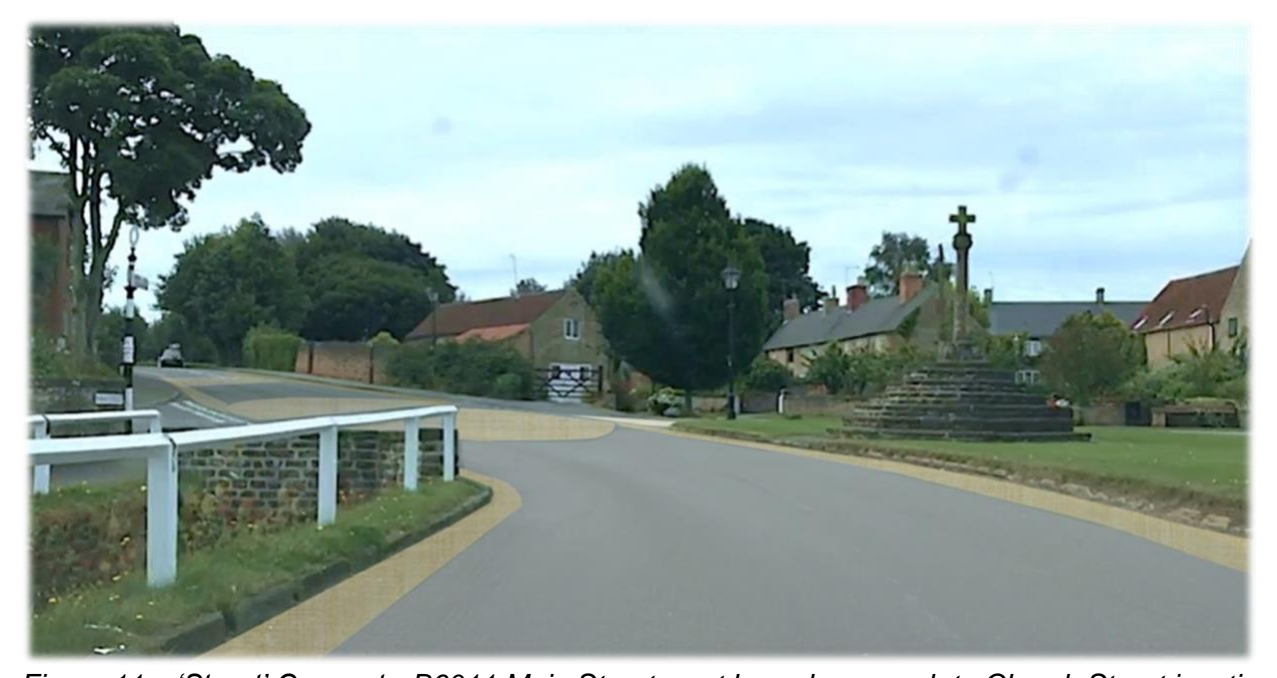
Figure 11 – 'Street' Concept - B6011 Main Street west bound approach to Church Street junction

Linby Central Area – The area between Linby Docks and the West Cross defines the active centre of Linby. Pedestrian crossing, especially crossing activity associated with the school near west Cross, Brook Farm and at the Horse and Groom pub/tea rooms is a key consideration, along with large parking area adjacent to the pub, bus stops and loading/parking areas.