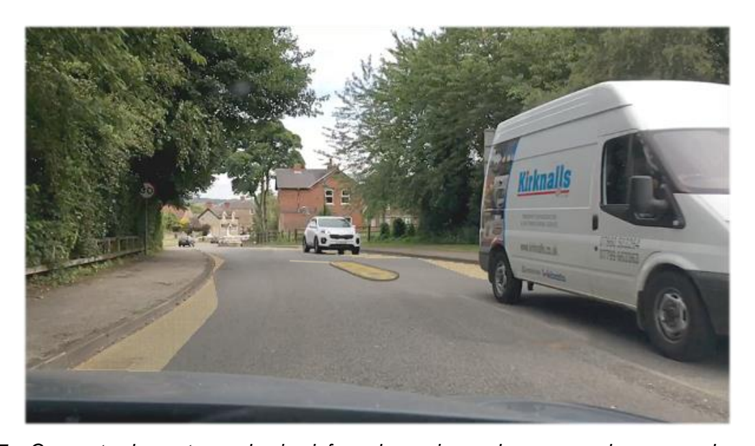
Figure 7 – Concept scheme to emphasise informal crossing and encourage lower speed approaching Linby Village centre