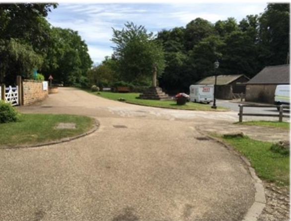
Figure 1 – Existing carriageway/footway surfaces within Linby