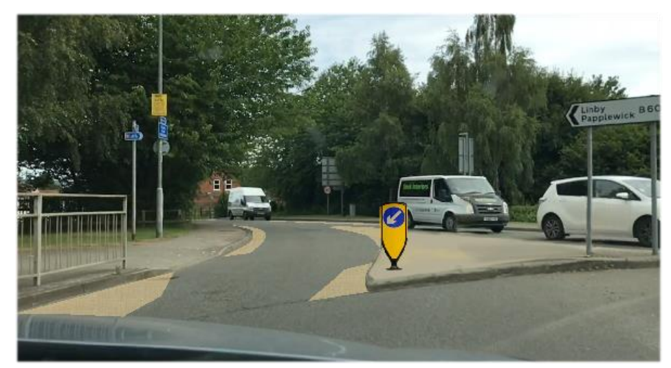
Figure 3 – Concept for speed reducing measures at exit to Main Street from the Wighay Road roundabout