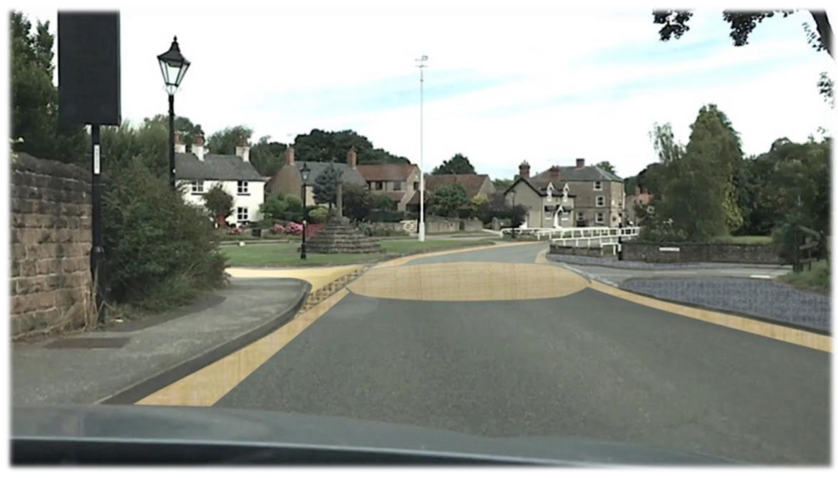
Figure 9 – Concept scheme highlighting Main Street / Church Street junction approaching Linby Docks

Linby Docks – During the preparation of the plan it was observed that the road marking through the Docks had been worn away for some time providing a good example of how the road could be visually changed to provide a degree of physiological traffic calming. The carriageway is narrower at this point and the wooden rails along the edge of the carriageway make the Docks a distinctive feature of Linby and Main Street; any further treatment must be carefully designed so as not to detract from this.