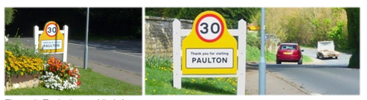
Figure 5: Typical speed limit / gateway treatment