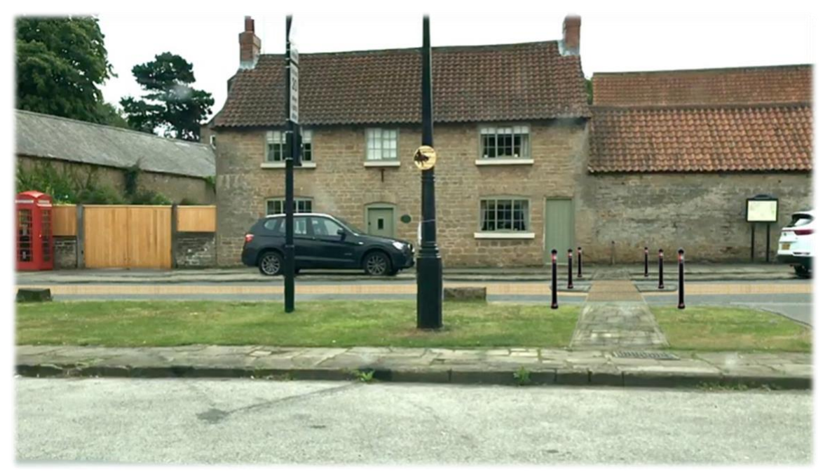
Figure 13 - Illustration of a concept for an informal pedestrian crossing within a scheme for village central area

The following Figures 14 & 15 show the existing layout of the B6011 Main Street adjacent to the Horse and Groom pub and an illustration of a conceptual scheme as described above.