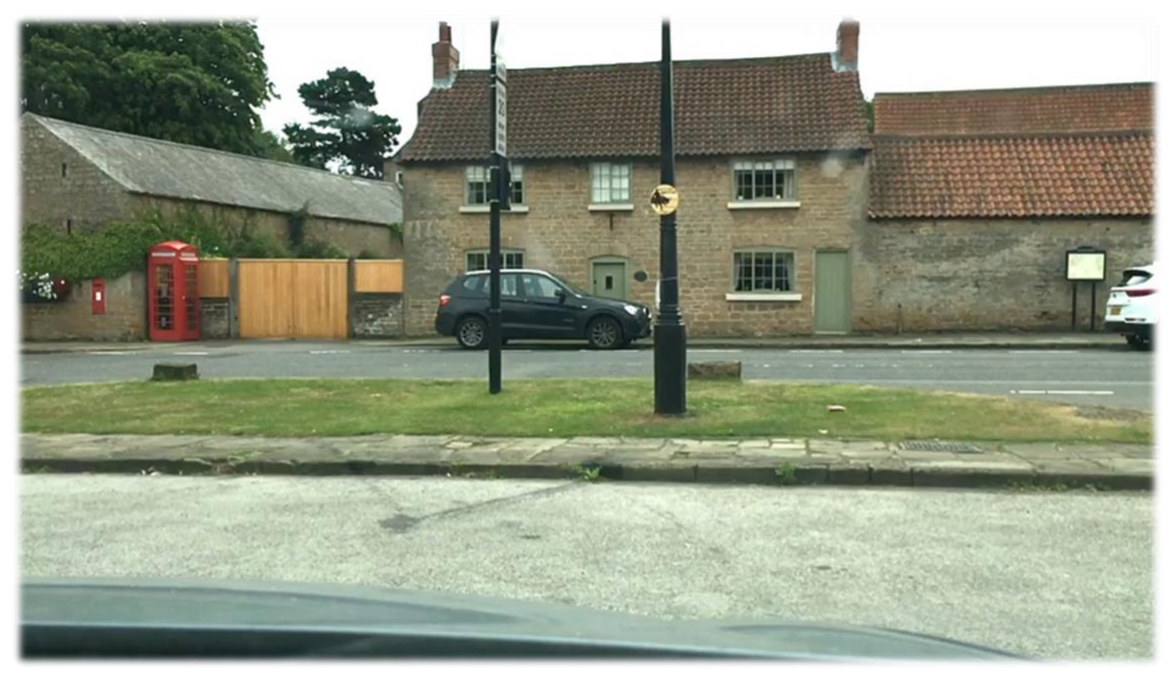
Figure 12 – Existing (2016) B6011 Main Street adjacent to Horse and Groom Public House and bus stops

The narrower carriageways would serve as a further speed reducing device at the crossing; however, if the highway authority requires a 3.5 metre carriageway either side of the refuge then symmetrical widening of the B6011 through the crossing (0.4 metres either side) would also provide a slight deviation in the traffic lanes which would also compliment the overall traffic calming effect. Note that the style of bollards shown in the Figure 13 are for illustration of the concept only; all street furniture should be chosen to compliment the conservation area setting.