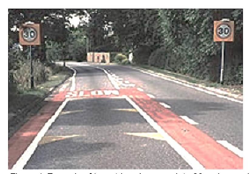
Figure 4: Example of 'countdown' approach to 30 mph speed limit