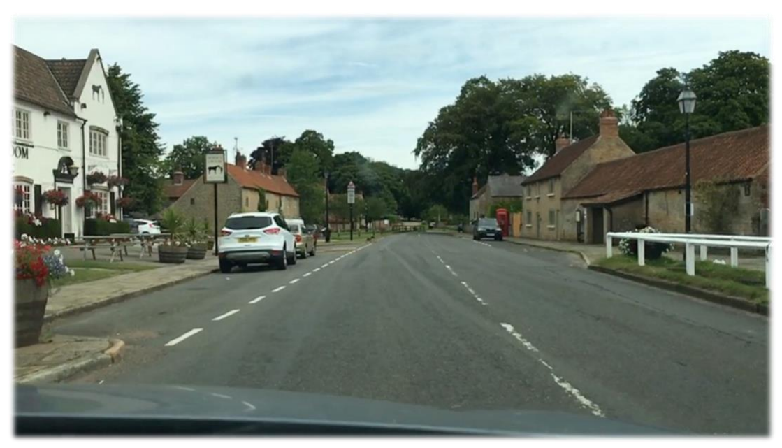
Figure 14 – Existing (2016) Main Street, Linby

The following Figures 14 & 15 show the existing layout of the B6011 Main Street adjacent to the Horse and Groom pub and an illustration of a conceptual scheme as described above.