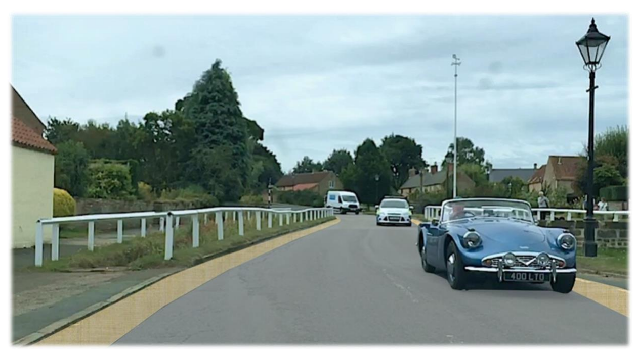
Figure 10 – 'Street' Concept – B6011 Main Street through Linby Docks