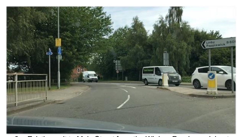
Figure 2 – Existing exit to Main Street from the Wighay Road roundabout

Figures 2 & 3 below show the existing layout of the roundabout exit to main Street and an illustration of the simple concept for reducing the exit width by enlarging the existing splitter island and further visual narrowing using a contrasting surfacing material.