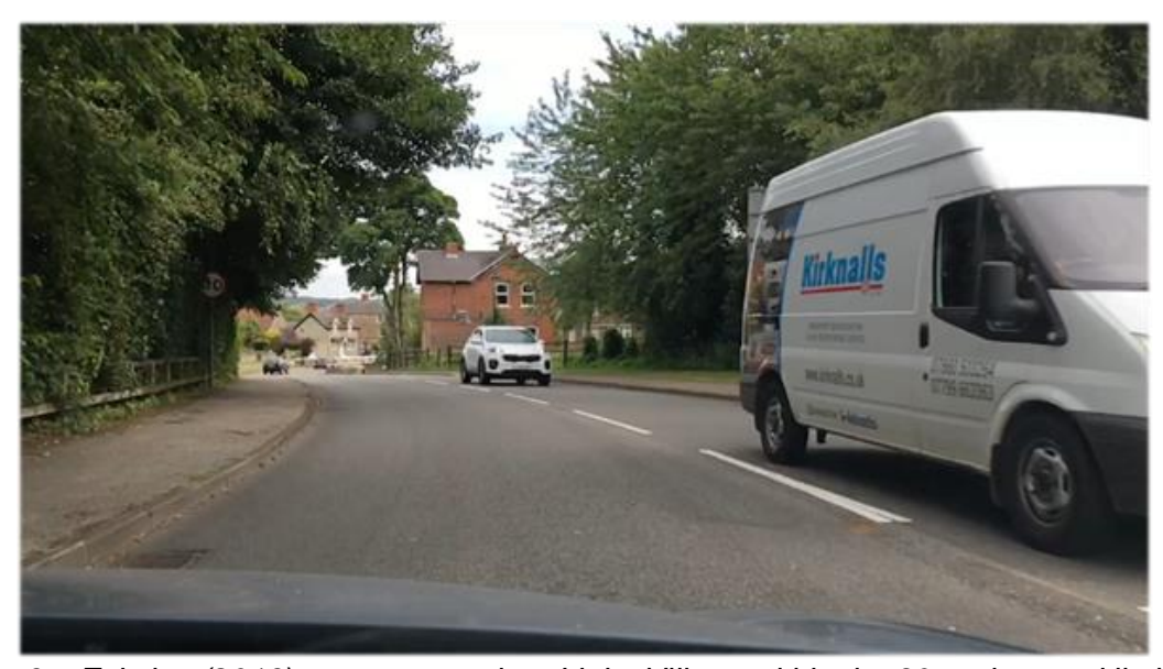
Figure 6 – Existing (2016) west approach to Linby Village within the 30-mph speed limit zone

Continuing the visual narrowing from the roundabout further measures could include slightly raised central features (for example, similar to speed cushions) to further emphasis the traffic calming effects. Provided a minimum physical width of 6-metres, (appropriate for bus route), can be maintained it may be feasible to install a splitter islands. Figures 6 & 7 show the existing situation and an illustration of traffic calming measures respectively.