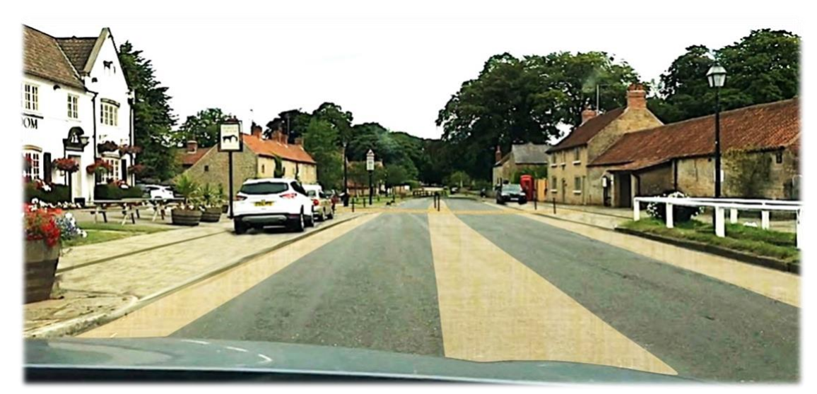
Figure 15 – Illustration of Main Street with shared footway/loading/parking areas and 'reengineered' carriageway

Many of the existing vehicle access points within the central area are very wide. Subject to swept path analysis of the largest vehicles expected to use these, narrowing the multiple wide access to the pub car park and the access road that runs parallel to Main Street. The entries could be defined by using rows of setts (for example) or a suitably contrasting textured surface material acceptable to the highway authority.