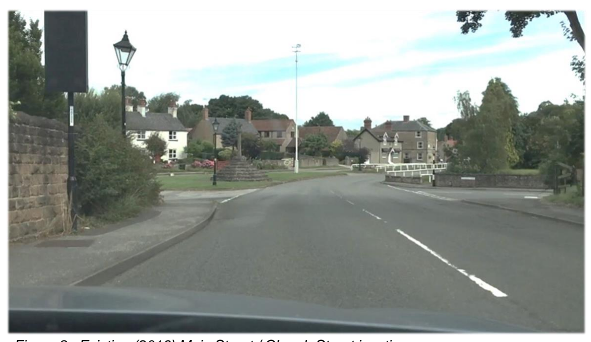
Figure 8 – Existing (2016) Main Street / Church Street junction

Figures 8 & 9 show the existing junction and an illustration of a possible scheme; realignment of the Church Street geometry to bring the give-way line forward, corresponding widening of footway and reduction in carriageway space, contrasting road surfacing either side of the B6011 Main Street/Church Street junction.